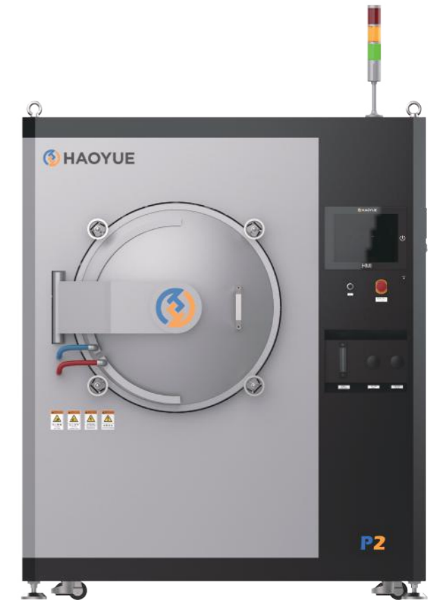
P2 Front View