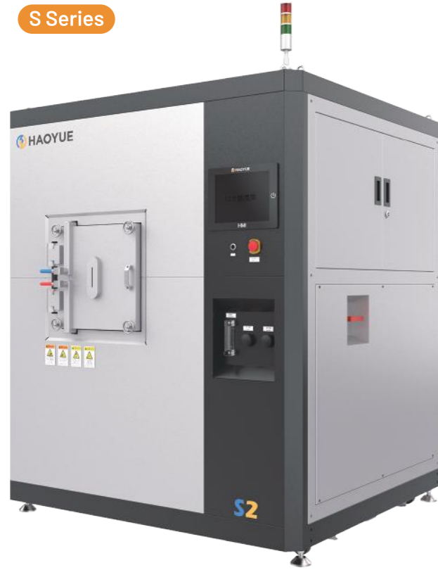
S2 Isometric View