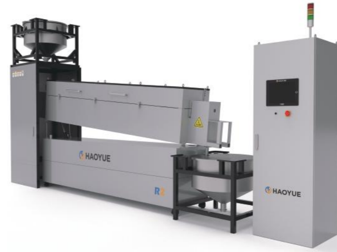
R2 Isometric View