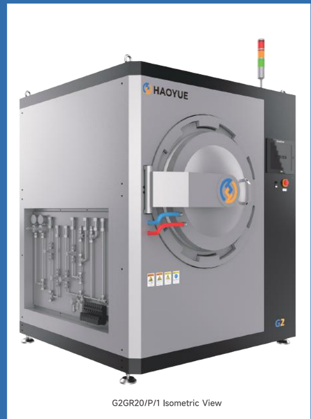
G2GR20/P/1 Isometric View

Gas pressure sintering refers to the sintering process first carried out under low pressure, followed by sintering the material to reach a fatigue state under normal pressure, and then sintering under high pressure (the result is further increasing the fatigue state of the material and quickly eliminating stress in the material). After the high-temperature and high-pressure sintering process, the material's mechanical properties (hardness, strength, toughness, etc.) are superior to ordinary sintering processes in all aspects.