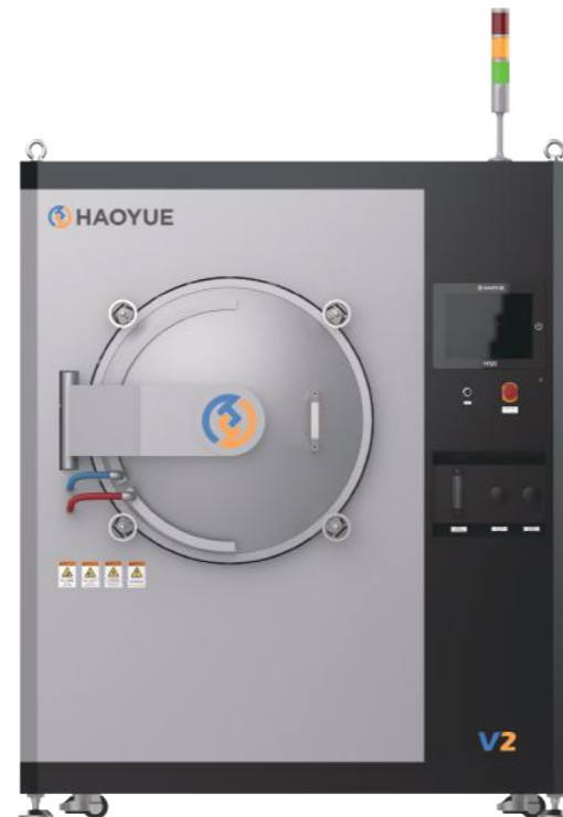
V2 Front View