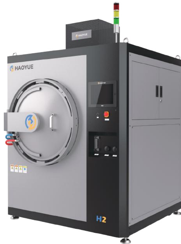
H2 Isometric View