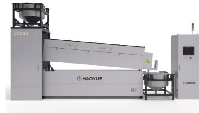
R2 Front View