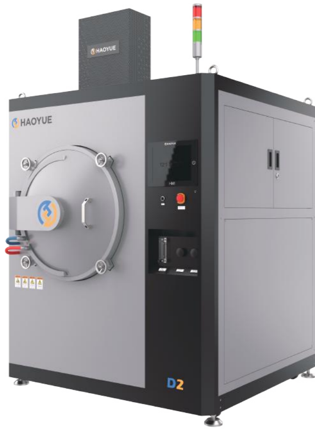
D2 Isometric View