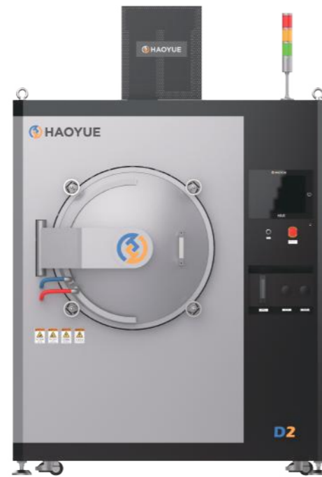
D2 Front View