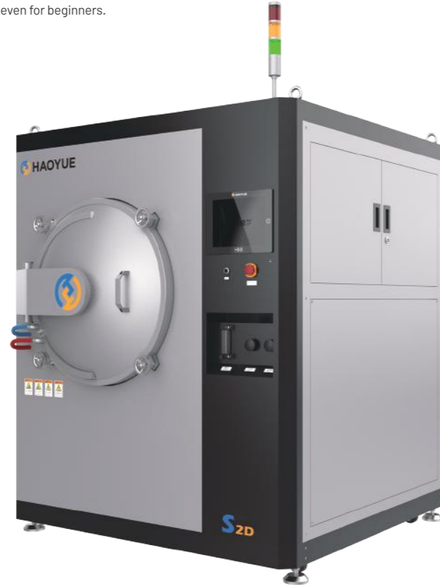
S2D Isometric View