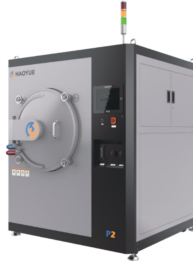
P2 Isometric View