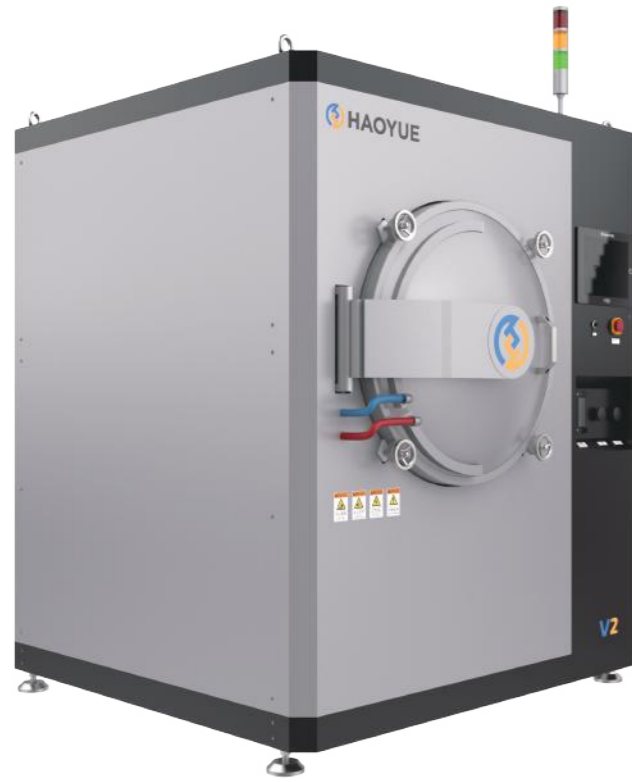
V2 Isometric View