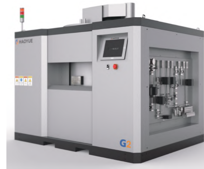
G2GR20/10 Isometric View